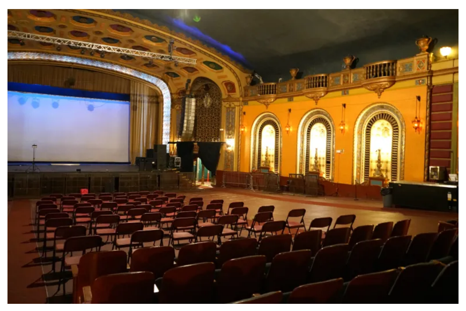
The inside of the Patio Theater at 6008 W. Irving Park Road as seen Oct. 4, 2022.