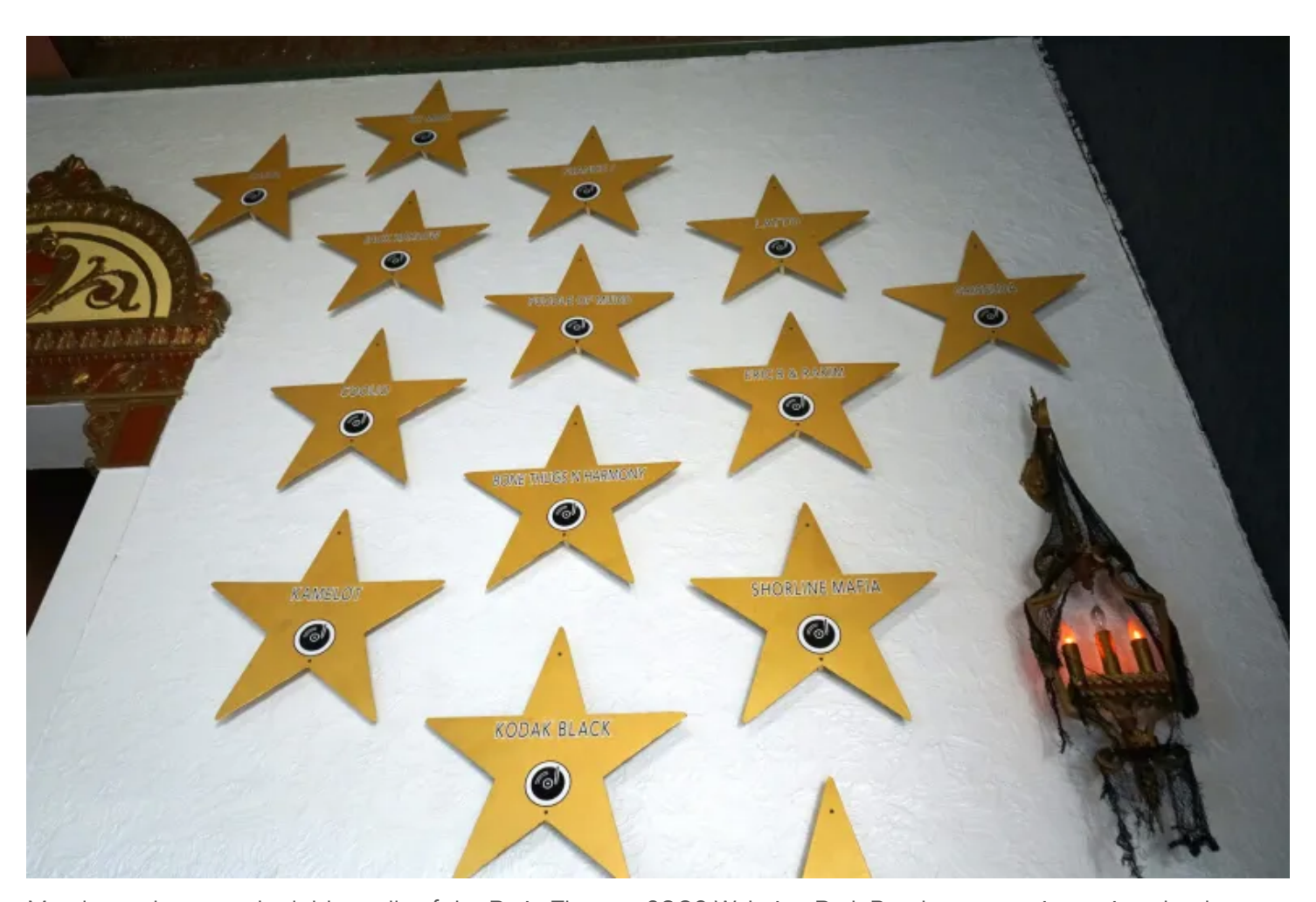
Metal stars hang on the lobby walls of the Patio Theater, 6008 W. Irving Park Road, representing artists that have

"It was inspired by the Hollywood Walk of Fame and is a neat way to honor and show the [theater] history," Bauman said.