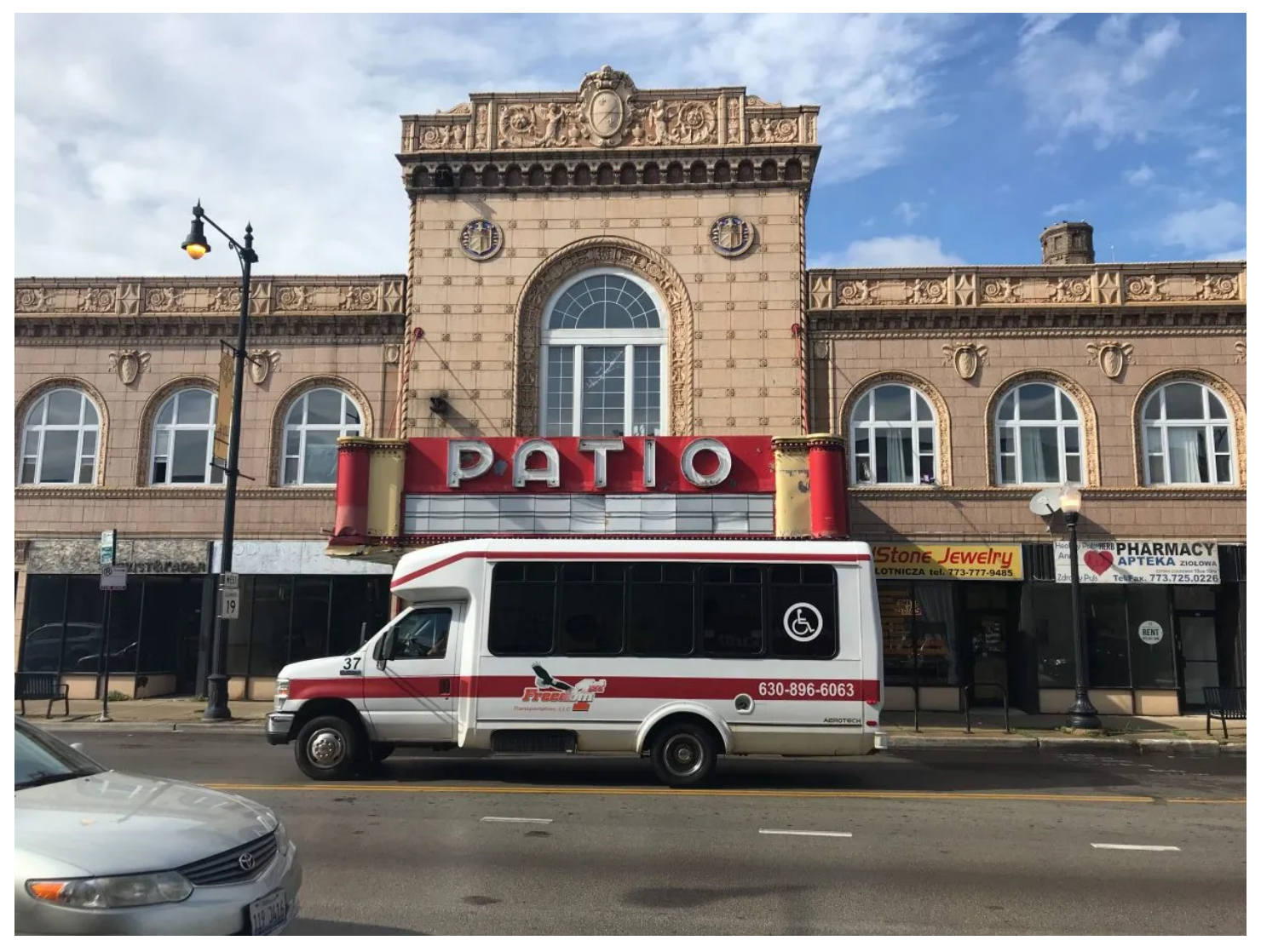
The Patio Theater's historic marquee has been clipped by passing trucks several times in recent years.