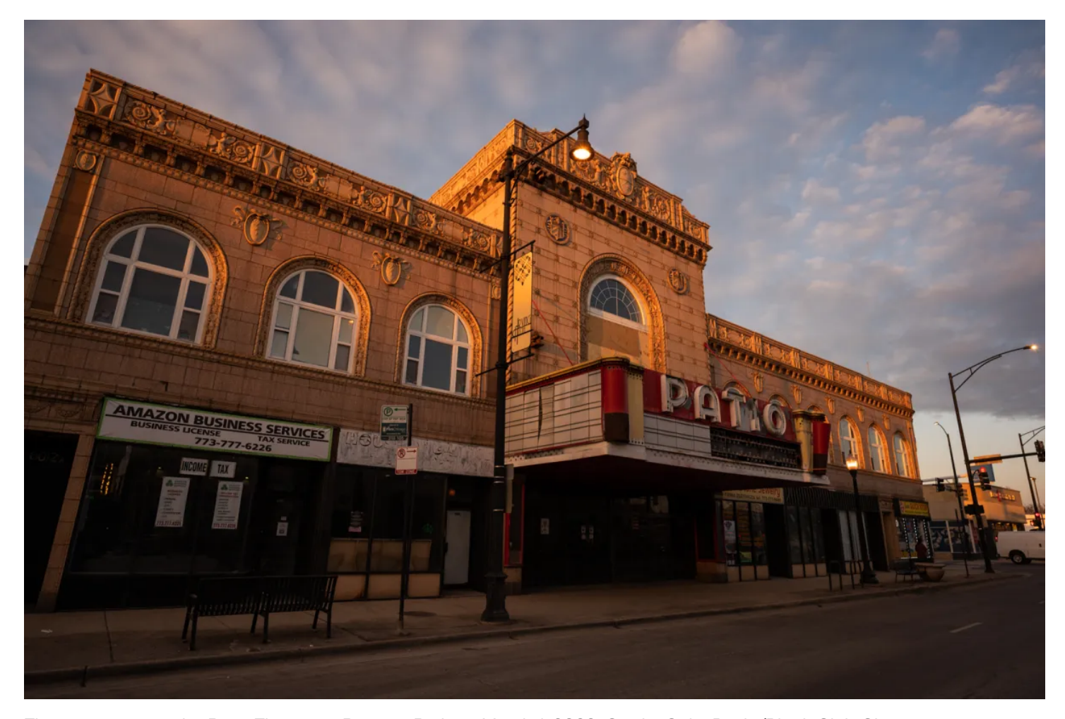
The sun sets over the Patio Theater in Portage Park on March 1, 2022.

By Ariel Parrella-Aureli October 6, 2022