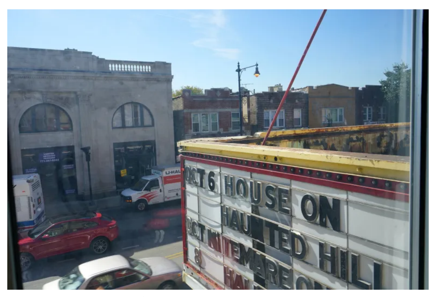
The Patio Theater's marquee is seen from the theater's green room on Oct. 4, 2022 in Portage Park.