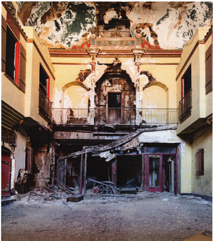
Abandoned image courtesy of Matt Lambros