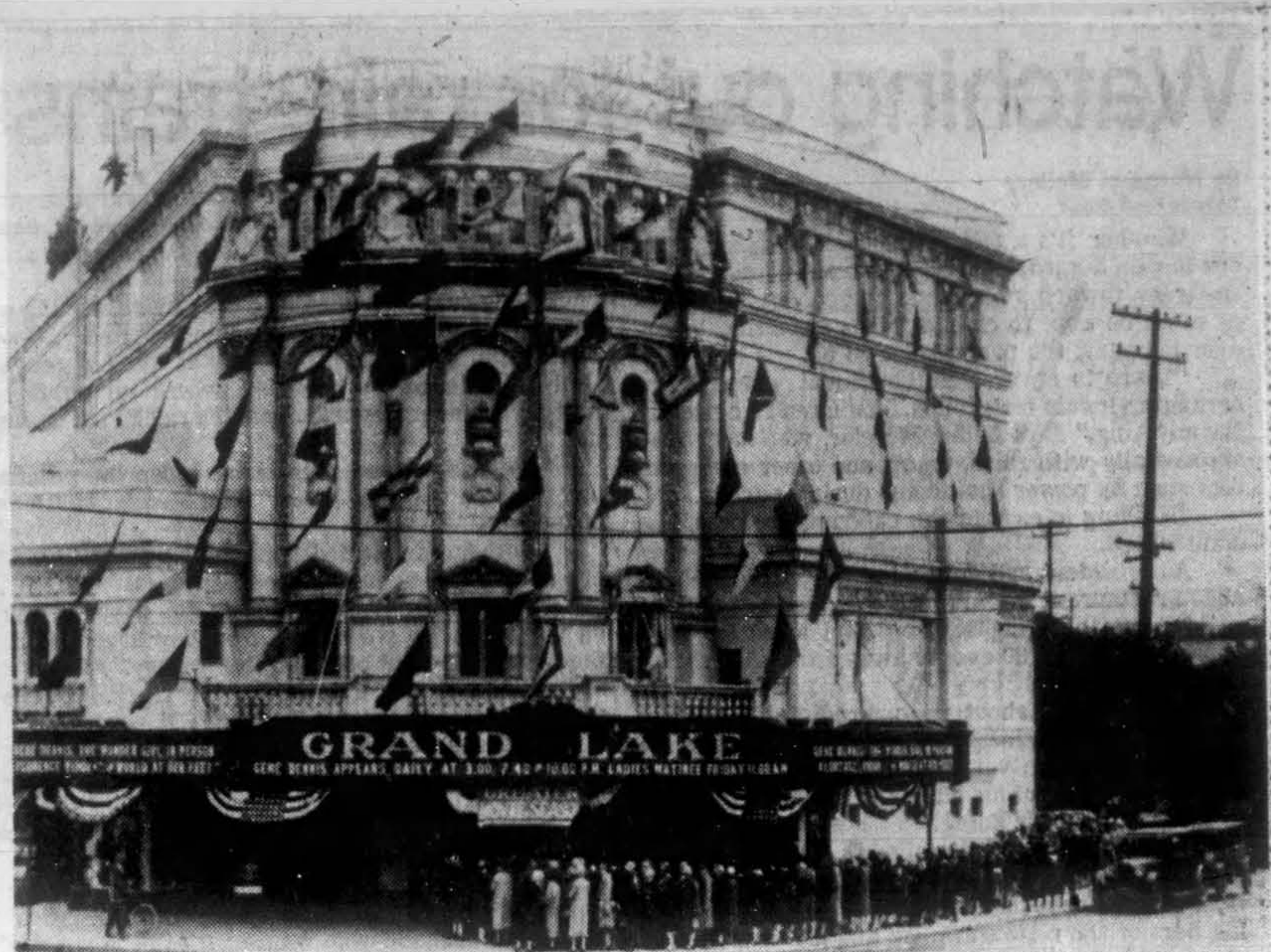
In 1926, women lined up for the 11 a.m. 'Ladies Matinee' on Fridays at the Grand Lake Theater.