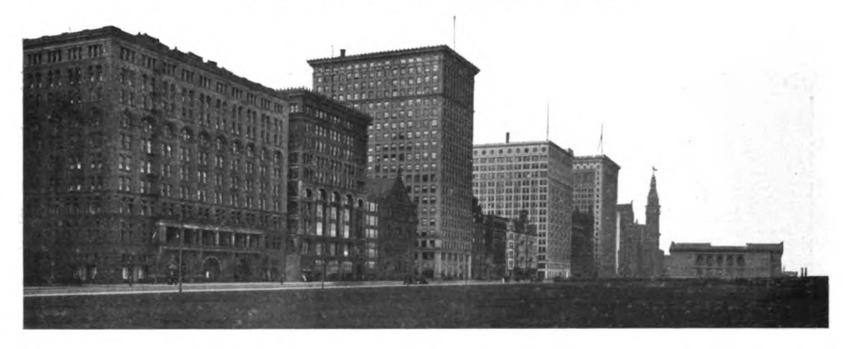
PART OF THE LAKE FRONT, CHICAGO. THE FINE ARTS BUILDING IS THE SECOND FROM THE LEFT, THE ART INSTITUTE ON THE EXTREME RIGHT