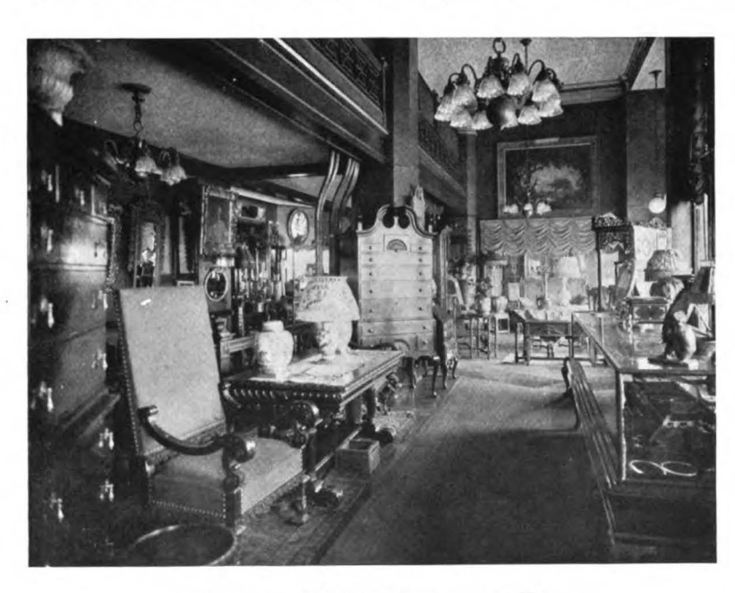
THE COWAN ROOMS ON THE MAIN FLOOR

The Assembly Hall, much used by clubs and societies, is on the tenth floor. This is the meeting place of numerous organizations, which, having rooms adapted only for everyday use, require a large hall for special occa-