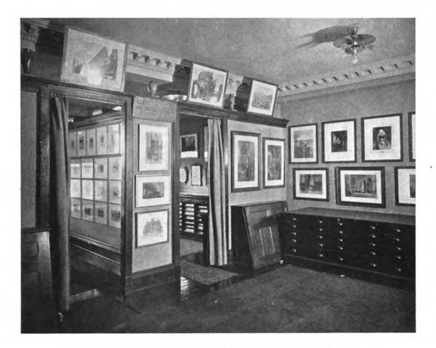
THE ROULLIER GALLERIES ON THE SEVENTH FLOOR

sions. The building is the home of some of the most interesting societies in Chicago. The Chicago Literary Club, composed of a group of gentlemen of many professions, with a taste in common for literature, and the Caxton Club, an organization devoted to bibliography, share the same reserved and admirable apartments; the Chicago Woman's Club, one of the most disinterested and effective organizations of women, has capacious rooms, fur-